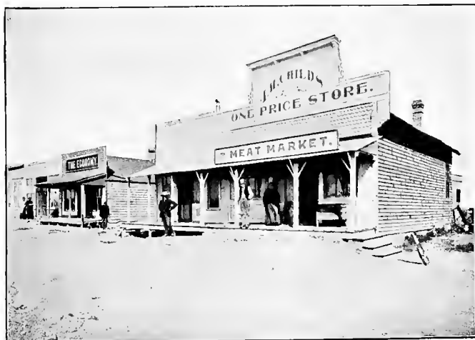
TOWN SITE STORES, FORT AMITY.